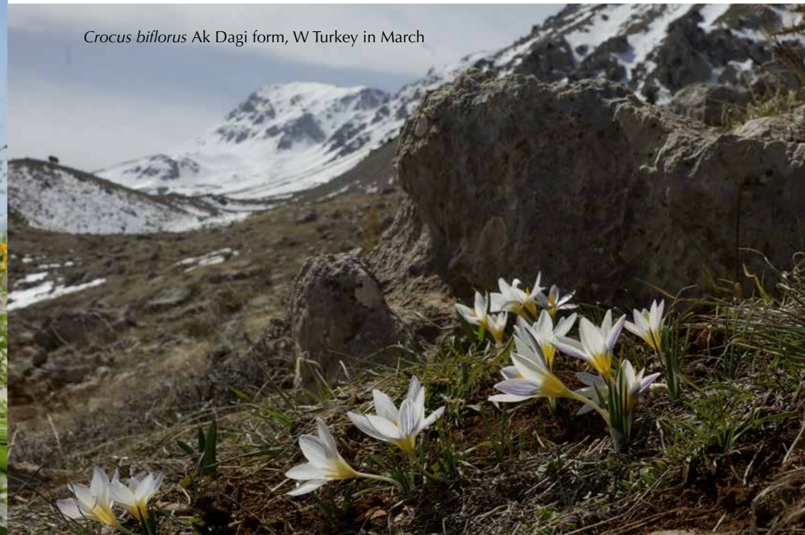
Crocus biflorus Ak Dagi form, W Turkey in March