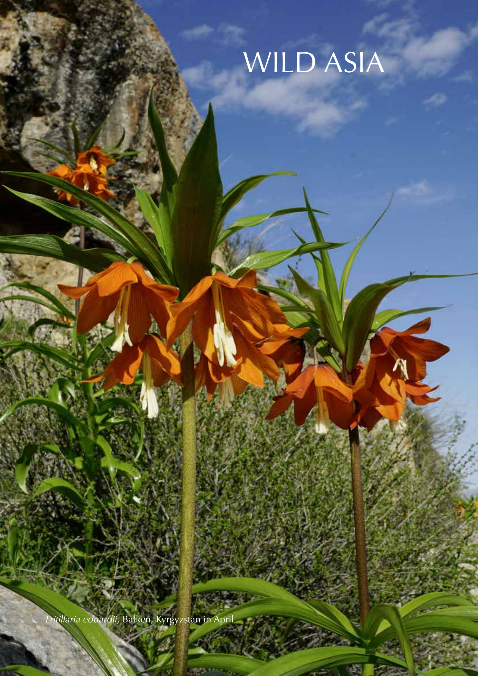
Fritillaria eduardii , Balken, Kyrgyzstan in April

Winter may be biting or at least nibbling around the edges, but before long the buds and bulbs of spring will be appearing and the landscapes of the Northern Hemisphere will once again be awash with flowers. Such bounty comes with an inevitable frustration - where to go to enjoy this fleeting flower-filled time? With travel now available to us once again, the lands of the former Silk Road offer up a beguiling choice and these certainly keep us busy every year.