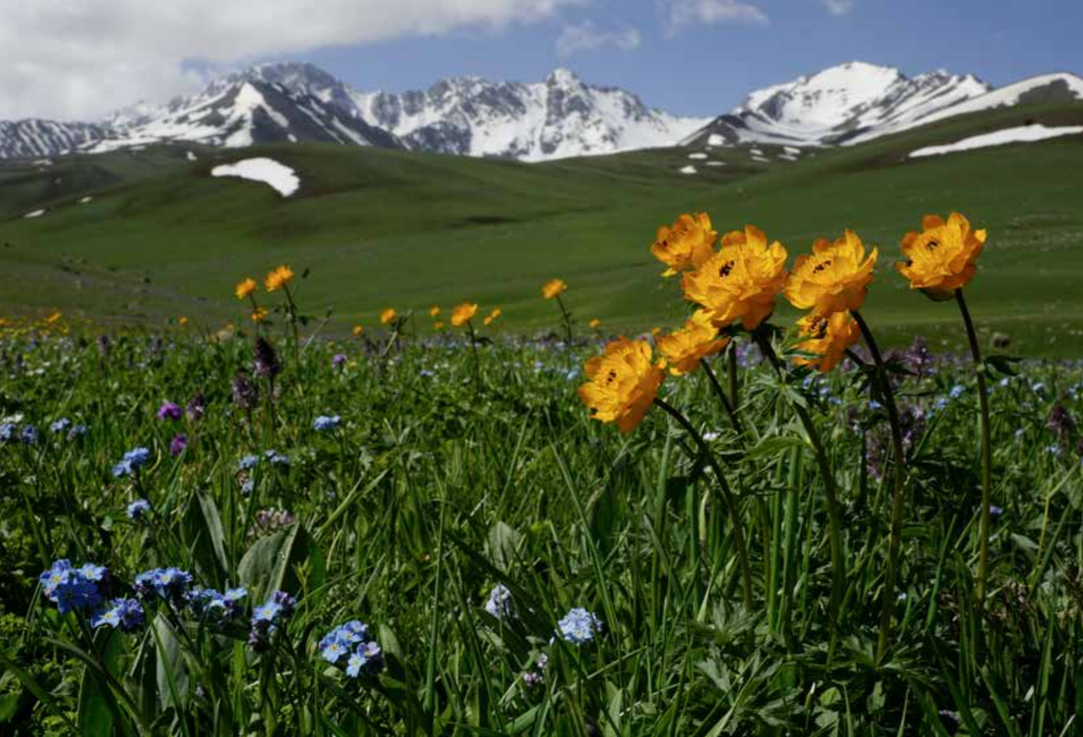
Trollius altaicus , Ala Bel, Kyrgyzstan in June.