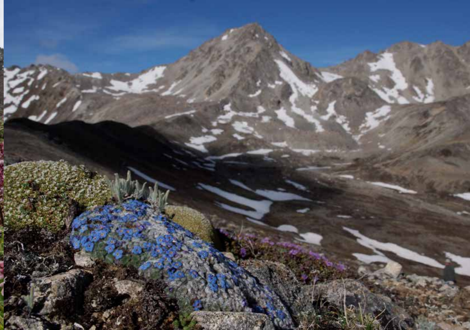
Chionocharis hookeri , Baima Shan, Yunnan, China in June.