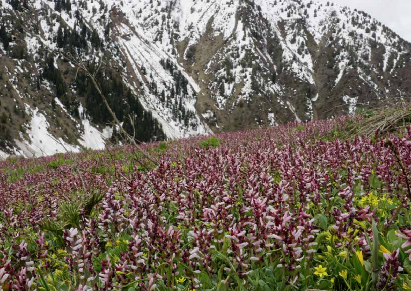
Corydalis ledebouriana , Ala Bel, Kyrgyzstan in April