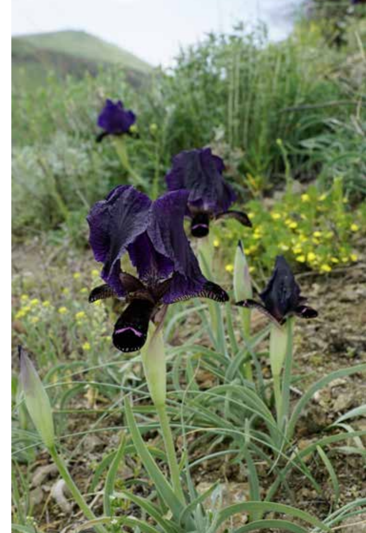
Iris paradoxa , Armenia in May

It's only whether my legs can keep walking that ever stops me, or needing to get back and pick the kids up from school on time!