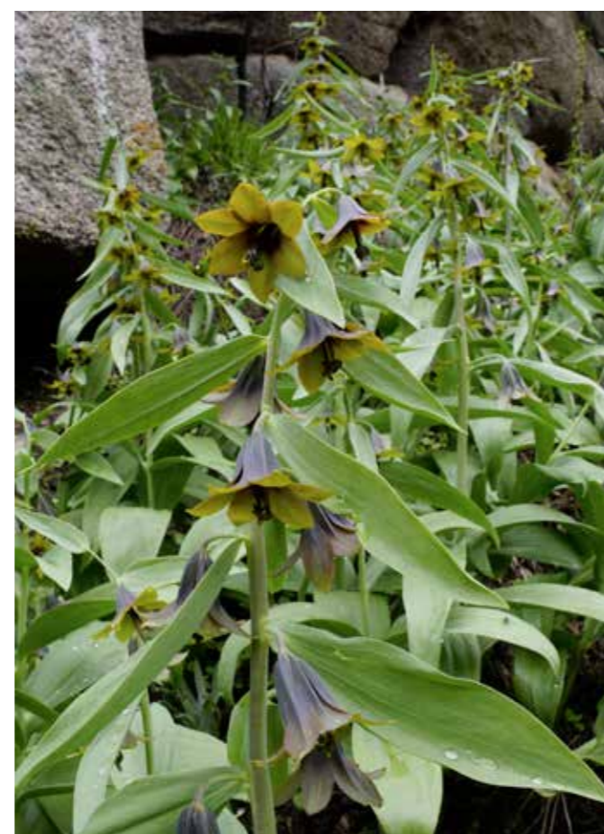
Fritillaria sewerzowii , Ala Bel, Kyrgyzstan in April (above)