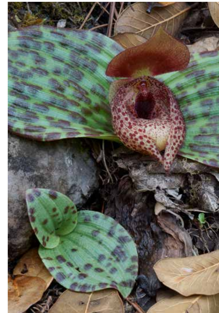
Cyripedium lichiangensis , Yunnan

From Ankara east to western China the Silk Road is unified by the Irano-Turano floristic region and a similar climate. Thus, the unlocking of the season is repeated farther east, in another botanical hotspot; Central Asia, where the riot of bulbs in April is backed by the majestic Tien Shan. The quantity some appear in is mind-blowing. The freedom of Asia is what makes it so special, the freedom to roam and explore in lands largely devoid of fences and walls. Such barriers would never suit the hordes of wandering stock that descend on these pastures in summer and so most areas are completely free of artificial impediments. I can say this largely extends to China, where there are still vast spaces in Yunnan, Sichuan and Qinghai that are fenceless and free. The stiff hike onto Baima Shan to see the sky-blue speckled cushions of Chionocharis hookeri is unfettered and only limited by one's lung capacity (at 4600-metres). A far cry from the territorial tendencies of much of the West. It did take make me a while to fully appreciate this unrivalled space, but once realised it is hard to give up.