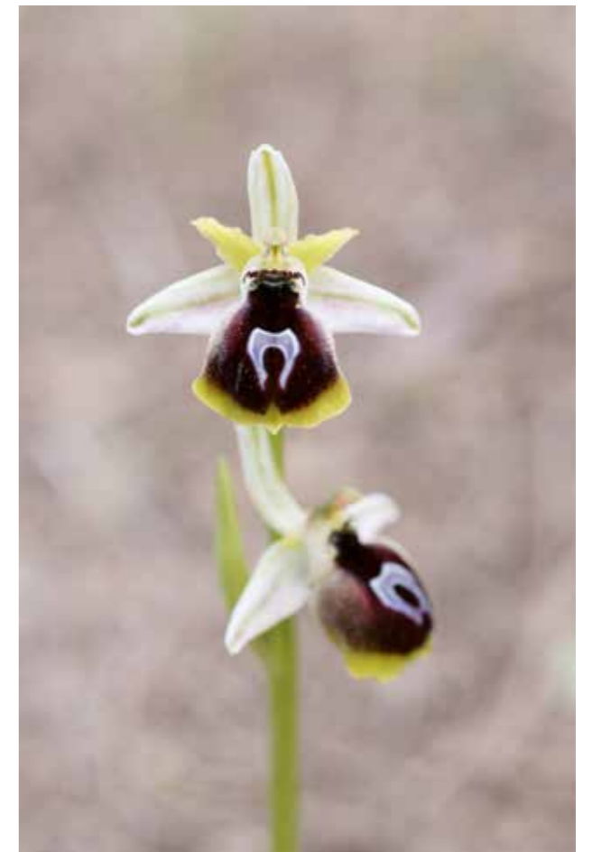
Ophrys argolica subsp. climacis , near Antalya

Turkey (naturally) features high on this list, and not just because we live here, it genuinely is one of the best plant destinations there is. In the Mediterranean, spring begins in January-February with orchids and bulbs. I had not realised quite how many crocuses grew around us until the ironic benefits of coronavirus meant I had the chance to properly look around and I found a great many populations and species of these and many other spring delights. Fast forward to May and a completely new suite of plants colours the higher in the Taurus mountains, and some of the finest plants appear now and into summer. The higher, cooler lands of the Anatolian Plateau (above 1000-metres) and the bulb-rich east