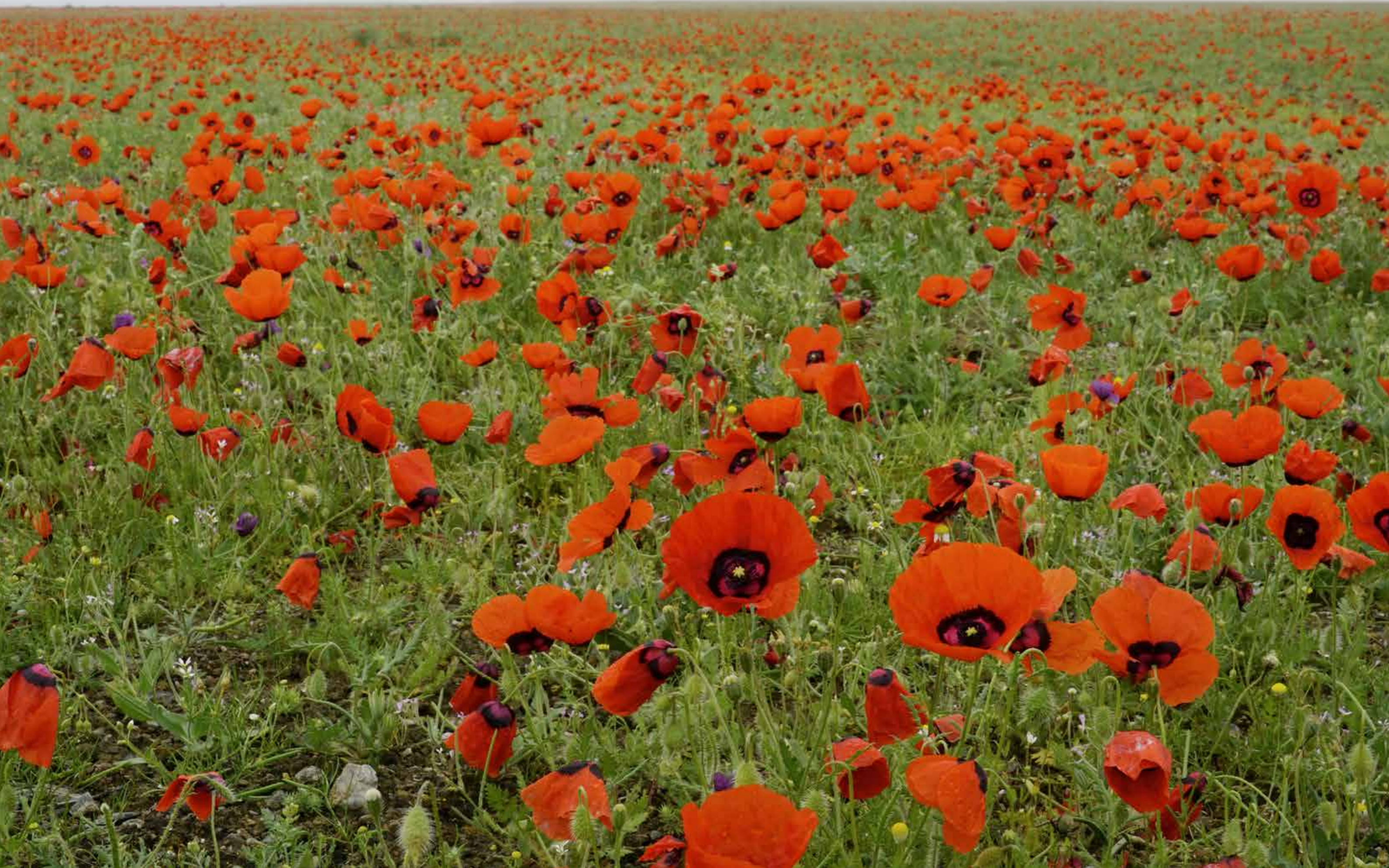
Papaver ocellatum , Kyrgyzstan in April